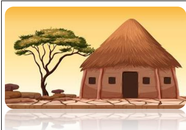
Some houses are made of mud, called mud houses.