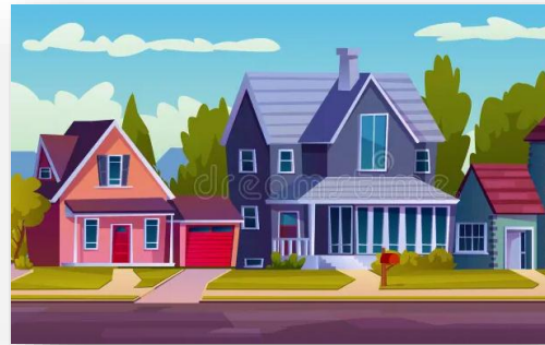
Houses: We live in a house.