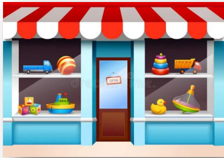
Shops: We buy things from shops.

Describe their neighbourhood (in terms of people, farms, shops, streets, parks and playgrounds, etc.)