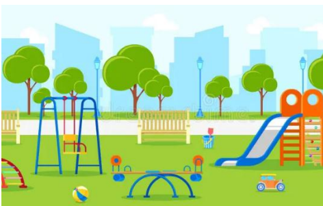
Parks / Playgrounds: We play in parks.