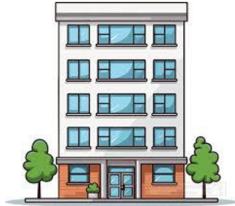
Some houses are small. They are called apartments.