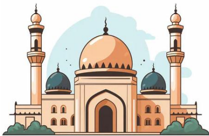
Masjid: We offer prayer in a masjids.