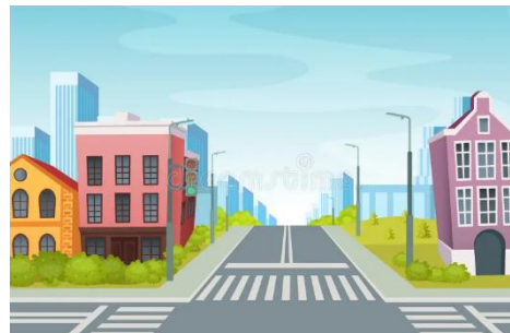
Streets: Streets are paths.