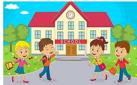
School: We study in a school.