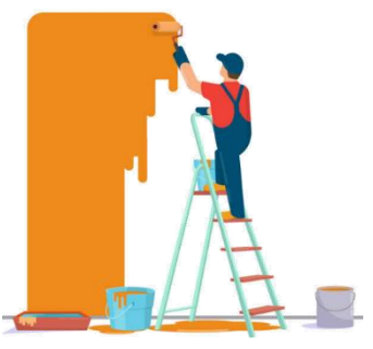
Painters paint walls, fences, and other surfaces, and sometimes create artwork.