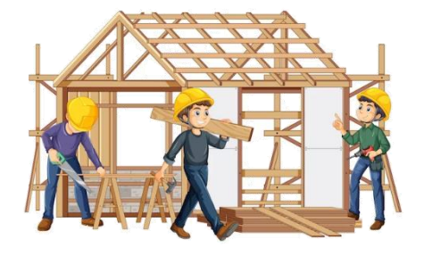
Builders make and fix buildings, like houses and schools, using materials such as wood and metal.